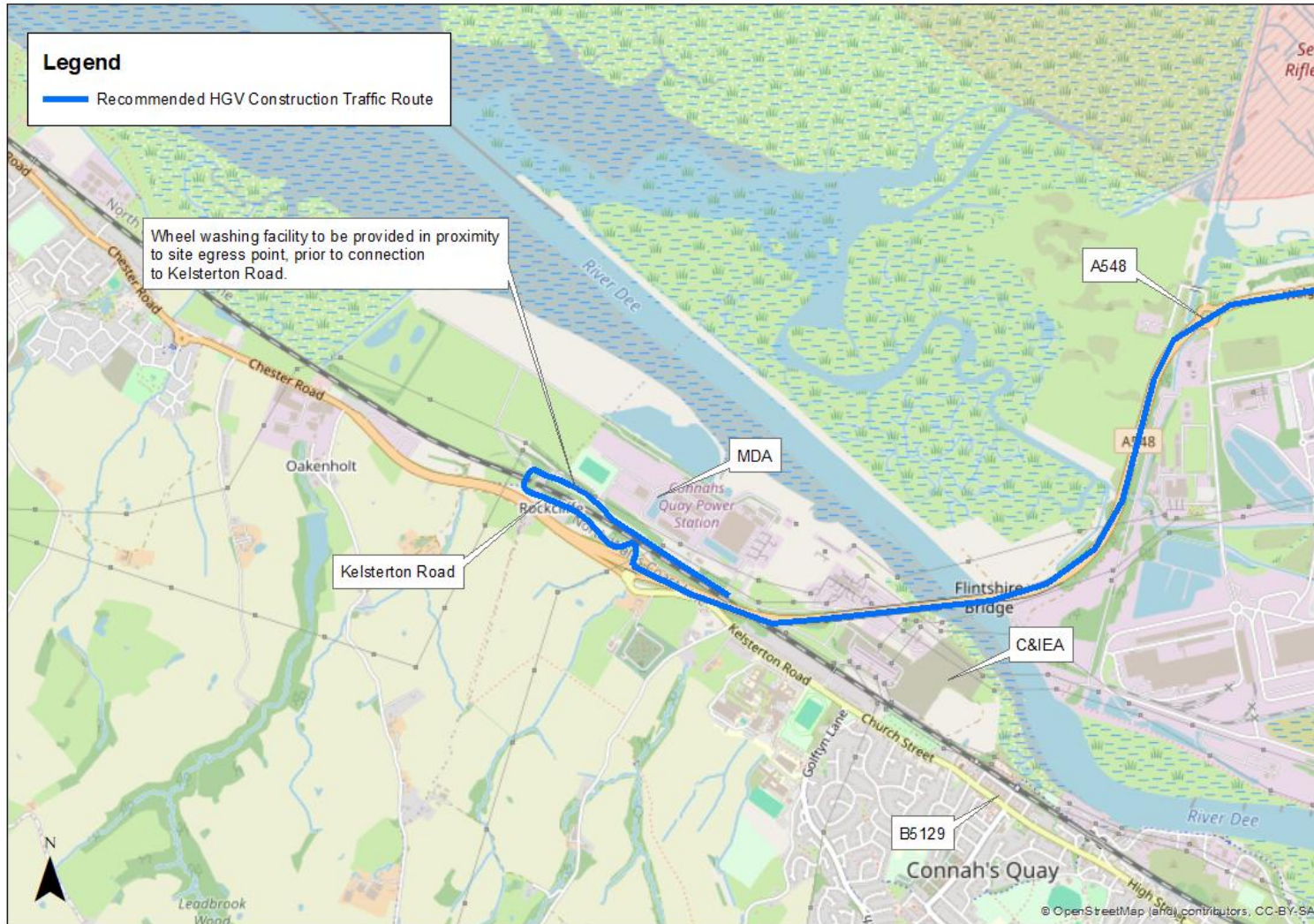
Figure 2: Construction Traffic Routeing